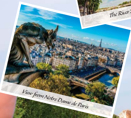
View from Notre Dame de Paris