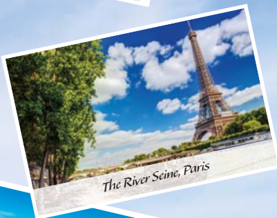
The River Seine, Paris