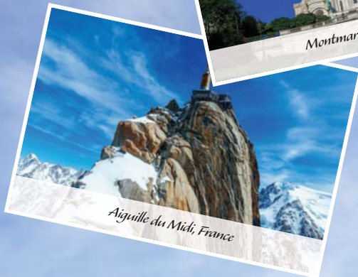
Aiguille du Midi, France